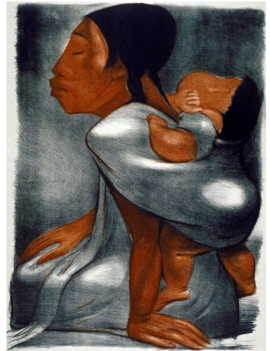
Mother Carrying Child on her Back (Mujer cargando un niño en la espalda), Jean Charlot, 1934.

First published in June 2018 Vol 37, No1, In God's Image