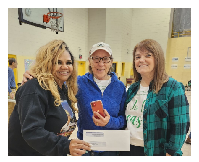
ECUMC Presenting a Check to Northcott Neighborhood House

Please contact Shelley Botchek at <u>shelley@botchek.com</u> or 262-389-0213 with questions.