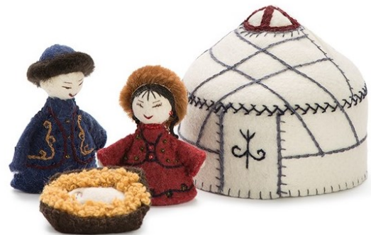
Nativity from Kyrgyzstan