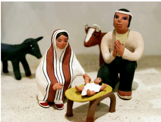
Acoma Nativity from New Mexico