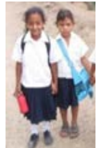
Two of our first students

These scholarships are truly a blessing, Becas con Bendiciones, for these students and their families.